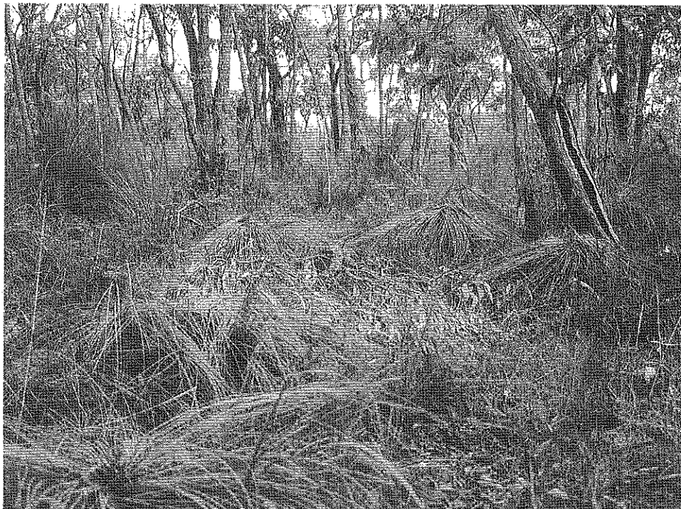
Compare the healthy stand of Austral Grass Trees (above) with the infected area below. Photos taken in the Brisbane Ranges National Park.

penetrated the root and prevent it from invading the rest of the root system and plant collar. Other plants, such as grasses and sedges, are able to rapidly produce new roots to replace those infected by the pathogen and so are able to withstand infection.