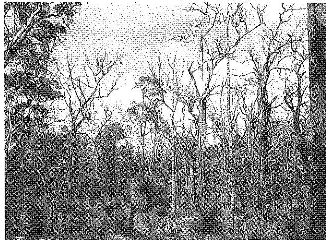
Phytophthora cinnamomi causing a mass collapse of Jarrah in Western Australia.

When introduced into an area, chlamydospores germinate to produce hyphae, a hair-like growth that can grow through the soil. Under warm, wet conditions, this mycelium can produce a structure called a sporangium, which in turn produces mobile spores