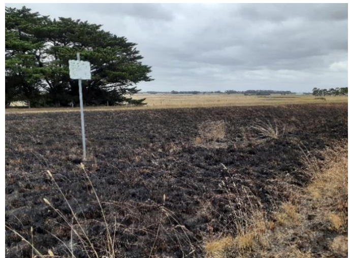
High quality grasslands roadside burnt by the CFA.