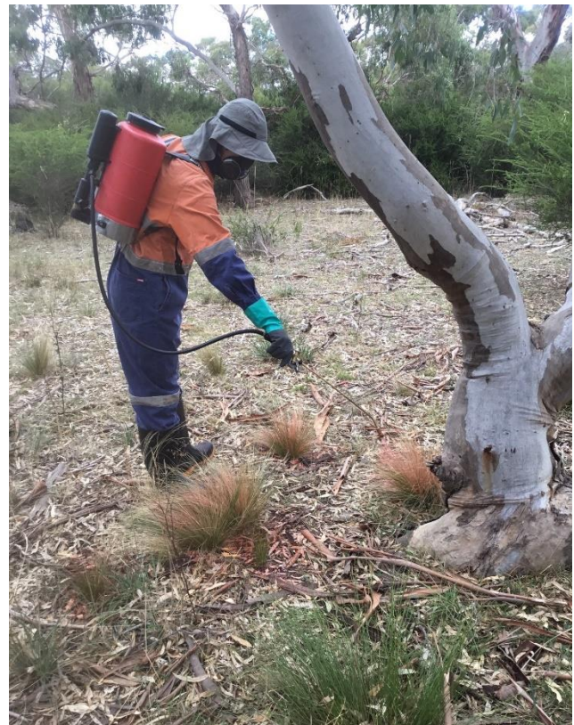
Spraying Serrated Tussock