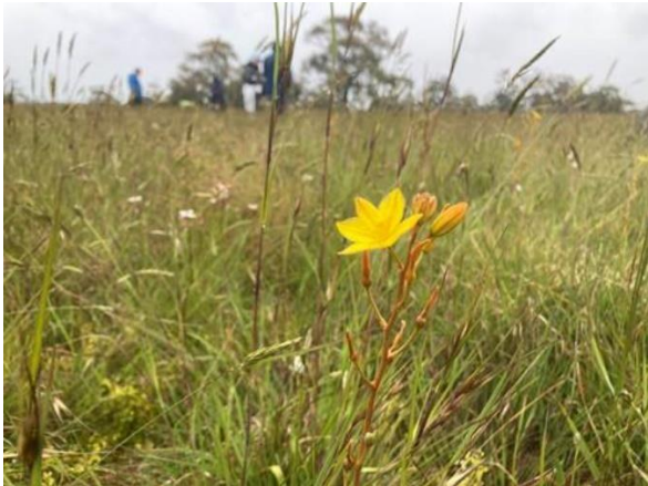
Bulbine Lilies at Woorndoo Cemetery